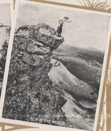
TOP O' THE WORLD