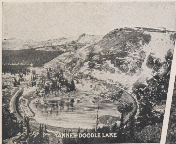
YANKEE DOODLE LAKE