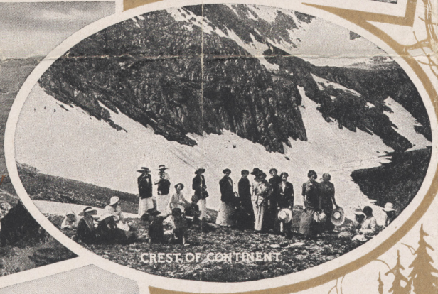
CREST OF CONTINENT